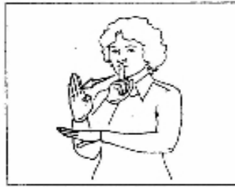
PROMISE, commit, pledge, swear