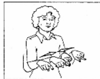
SAME, like, alike