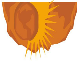
Jesus Rose After 3 Days!