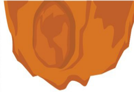
Jesus Was Buried