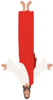
Resurrection of Jesus